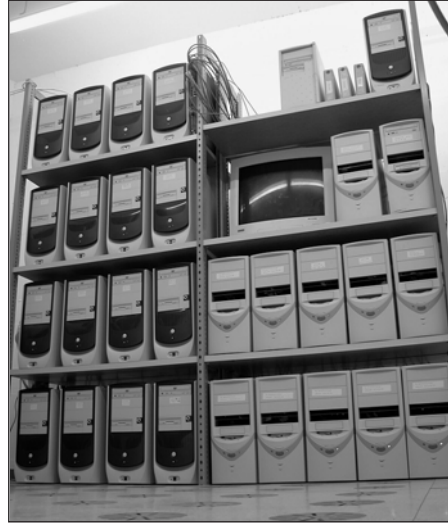
Fig. 1. Part of the Linux cluster installed at the Division of Climate and Environmental Physics of the Physics Institute at the University of Bern, Switzerland. The PCs are connected by a 1-Gbit network, and the slower nodes by a 100-Mbit network.

The limitations of the Linux cluster network can be shown using different network speed.