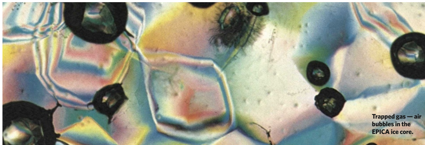
Trapped gas — air bubbles in the EPICA ice core.